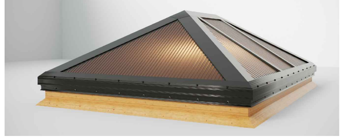
Actual product may not be exactly as shown