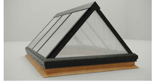
Actual product may not be exactly as shown